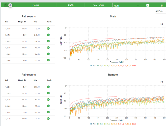
TREND AnyWARE Cloud Test Result screen

To trade in your certifier today, please call 973-957-7700 or email contactus@trend-networks.com