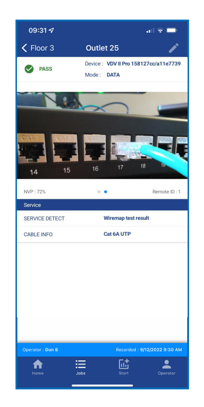
Attach photos to test results using the app for complete documentation.