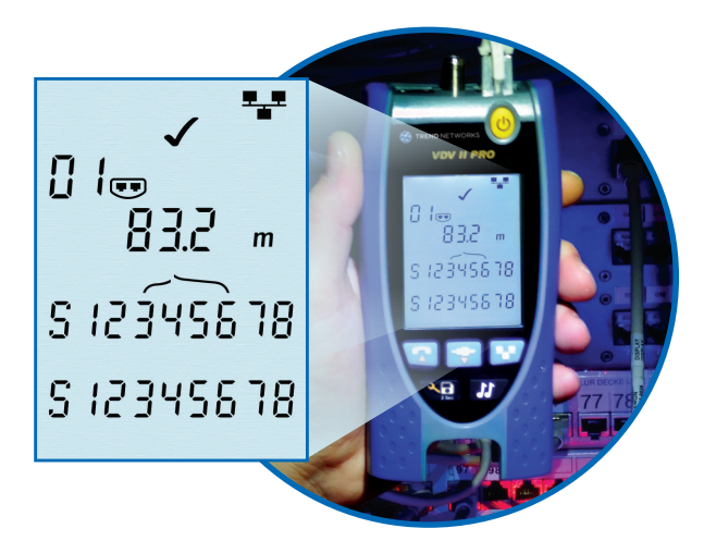
Wiremap with length